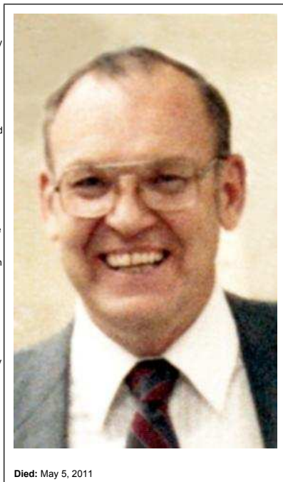
Died: May 5, 2011