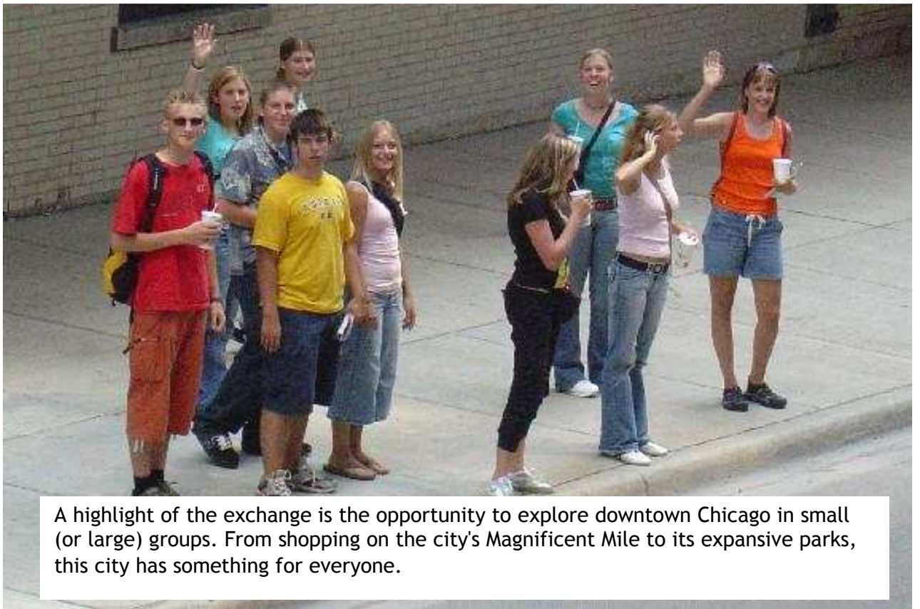
A highlight of the exchange is the opportunity to explore downtown Chicago in small (or large) groups. From shopping on the city's Magnificent Mile to its expansive parks, this city has something for everyone.