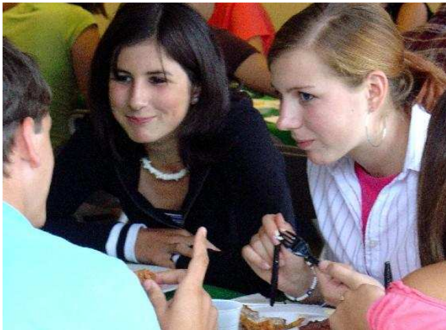
These girls' faces tell the whole story: everyone had fun at the farewell party and during the entire exchange!