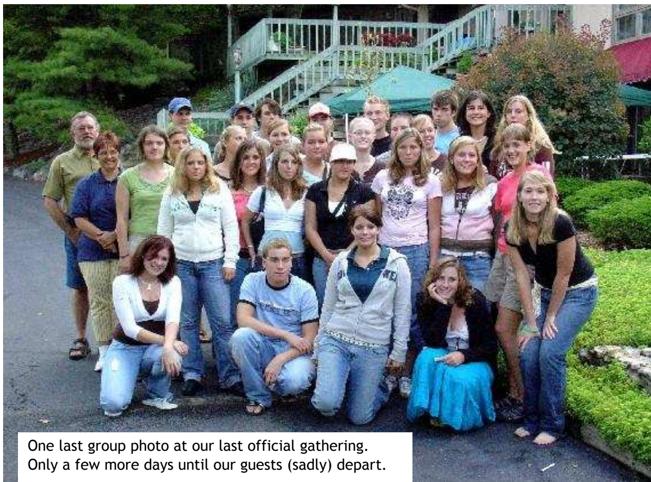
One last group photo at our last official gathering. Only a few more days until our guests (sadly) depart.