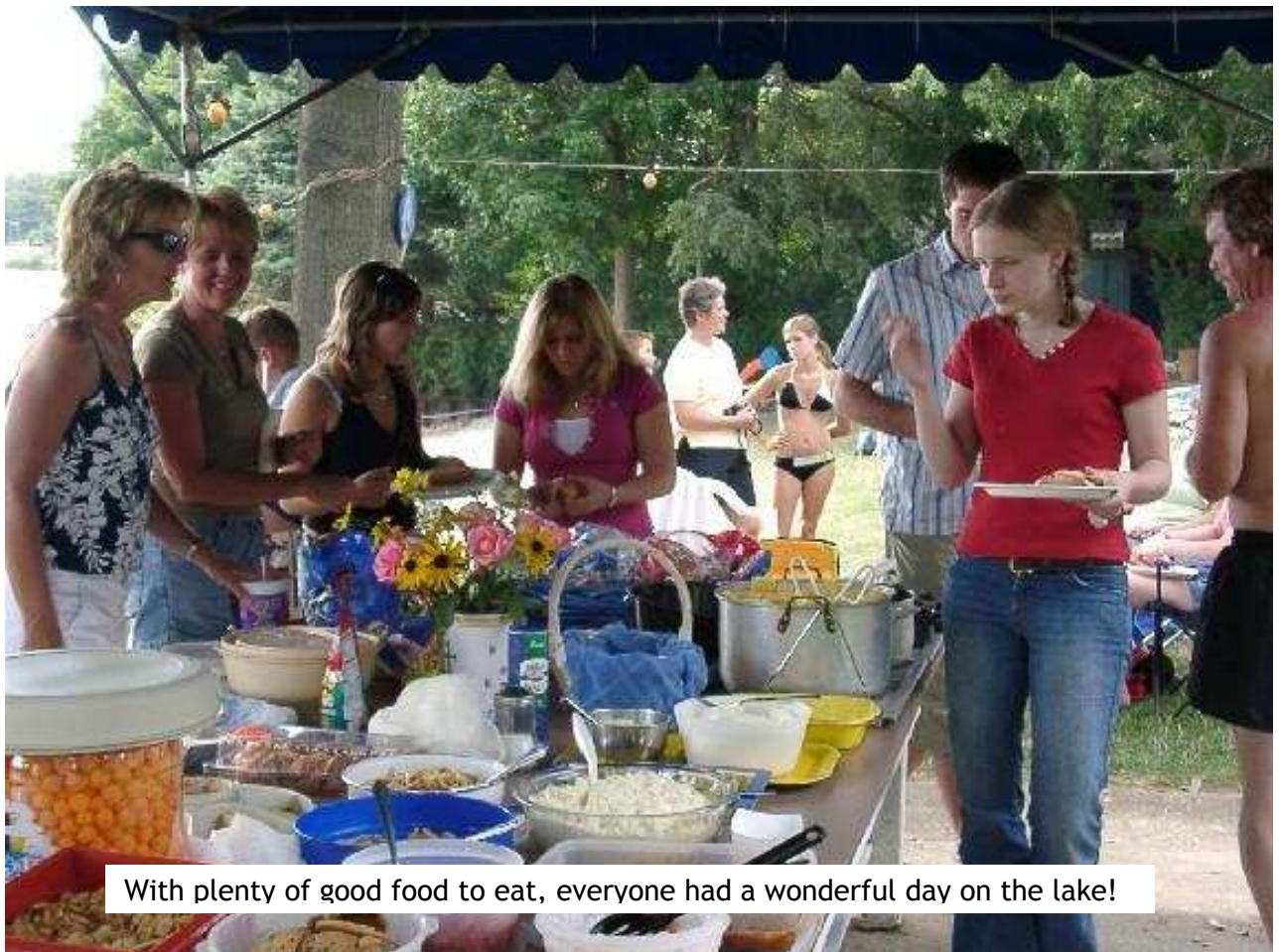
With plenty of good food to eat, everyone had a wonderful day on the lake!