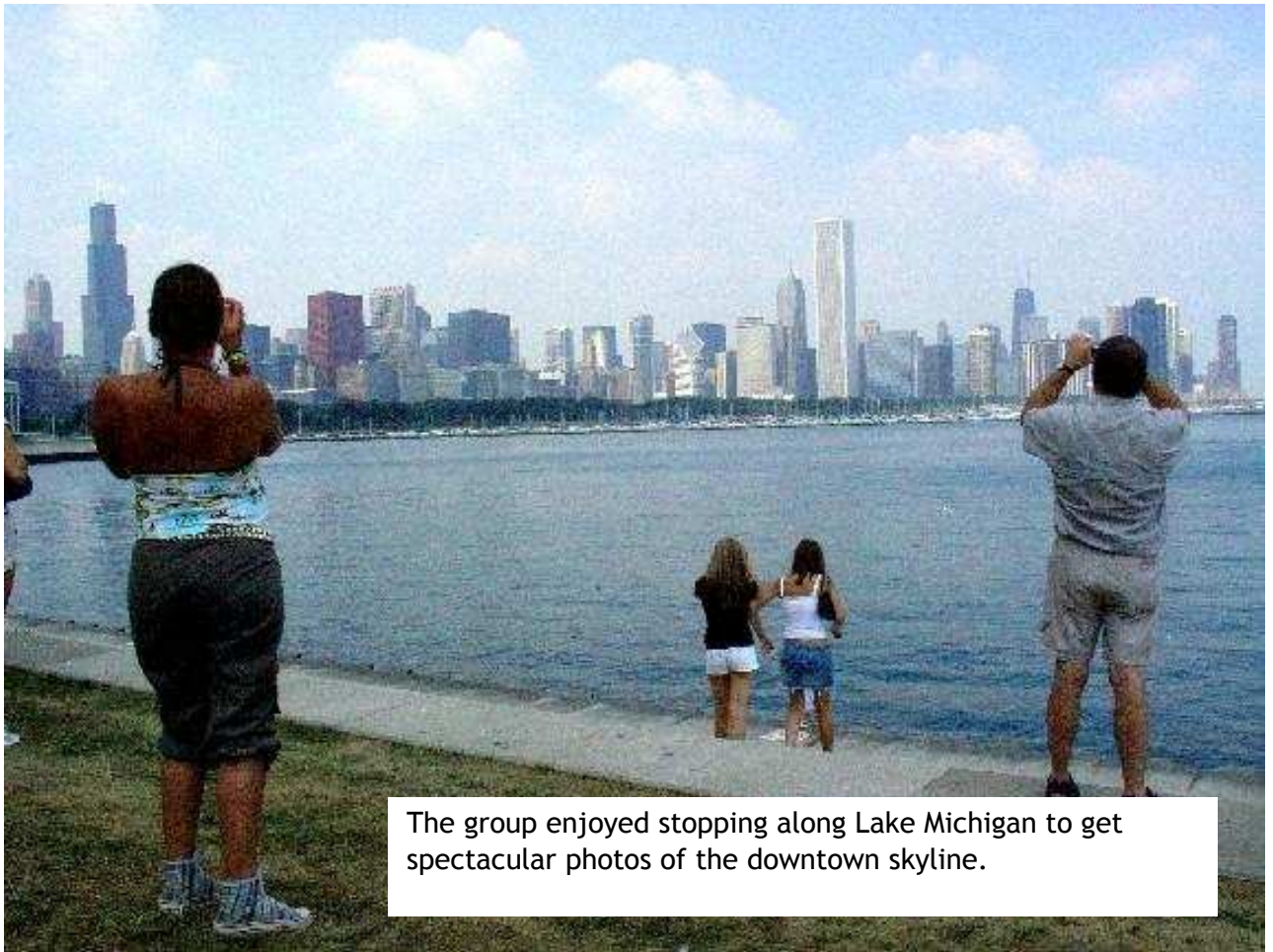
The group enjoyed stopping along Lake Michigan to get spectacular photos of the downtown skyline.