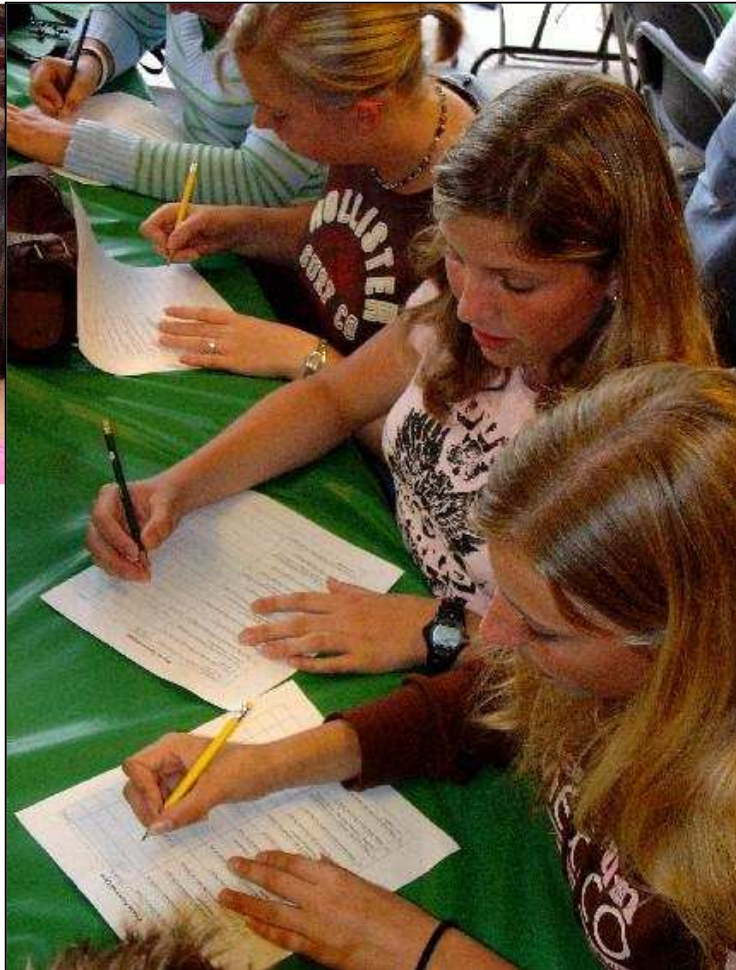
German guests were given a quiz (by their own chaperones!) to see how much they had learned about Peoria and Illinois.