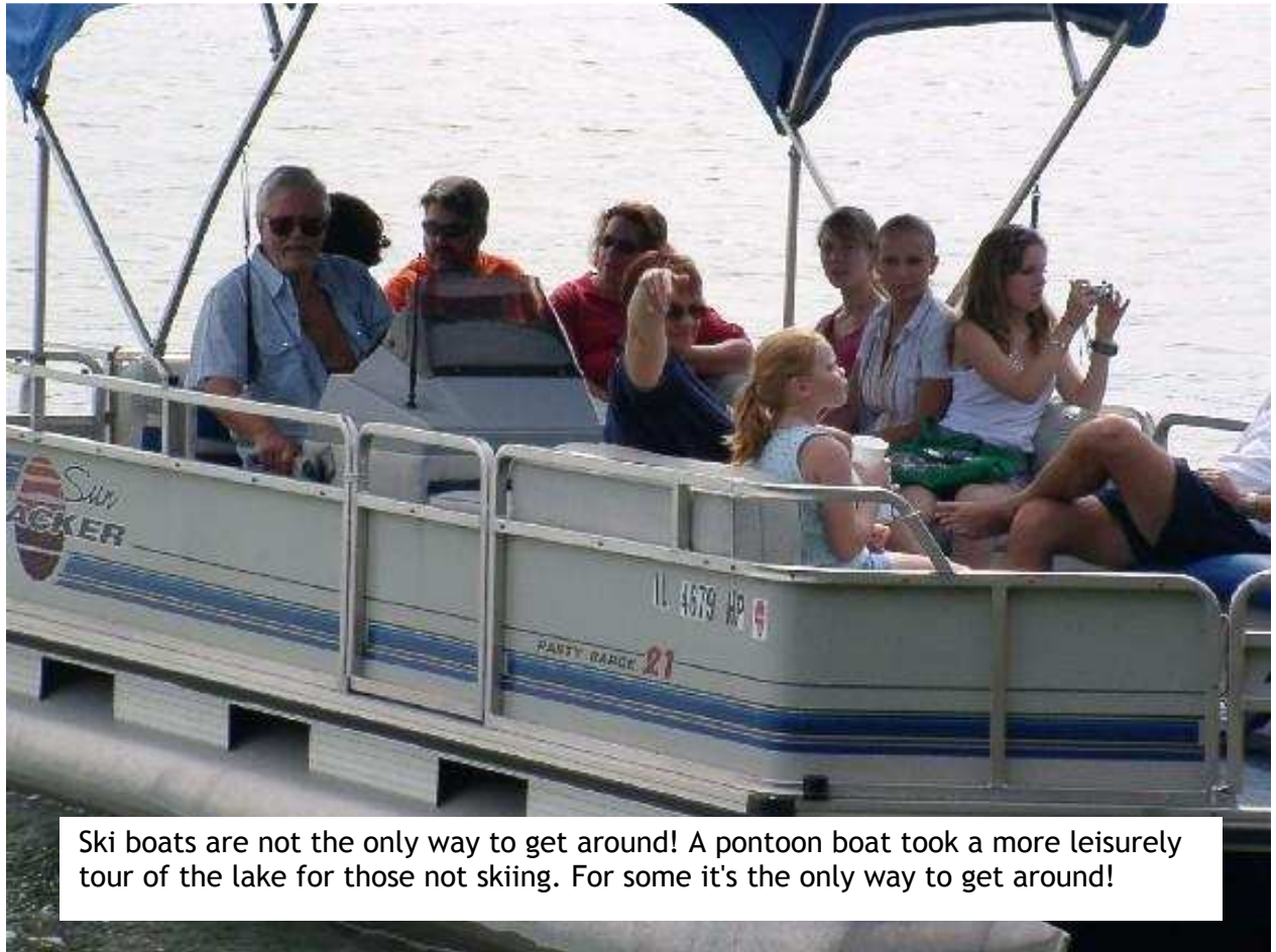
Ski boats are not the only way to get around! A pontoon boat took a more leisurely tour of the lake for those not skiing. For some it's the only way to get around!